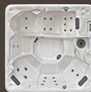
Twilight - 5 Seats

The LifeStyle Series offers a variety of models designed to fit every budget without sacrificing quality or comfort.