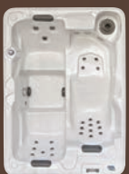
Mirage - 3 Seats

WAVE™ Wireless Control WAVE™ wireless control lets you manage your spa through a smartphone app, adjusting spa functions anywhere in the world with a reliable wireless connection anytime.