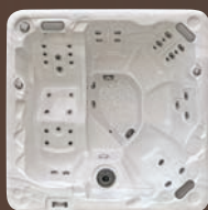
Seasons - 5 Seats