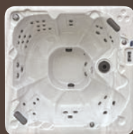
Summit - 7 Seats